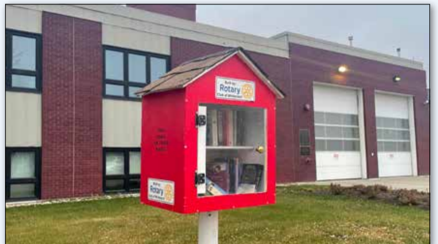
The mini library is bright red and stands out in front of the burgundy coloured department.