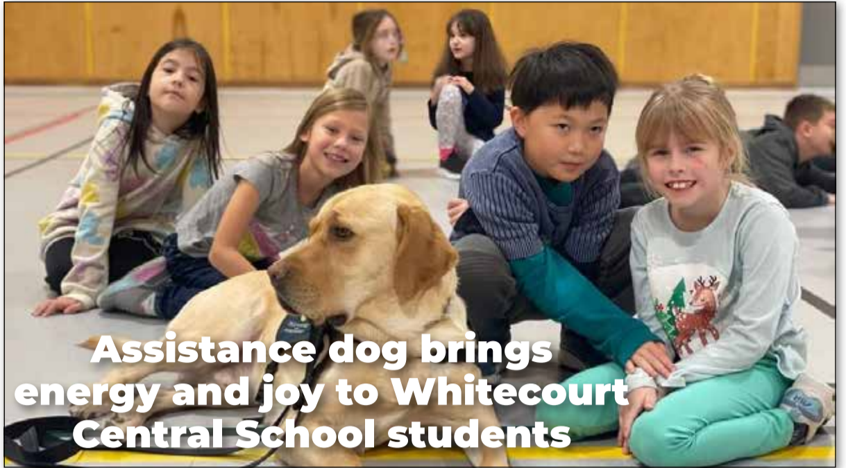
Assistance dog brings energy and joy to Whitecourt Central School students