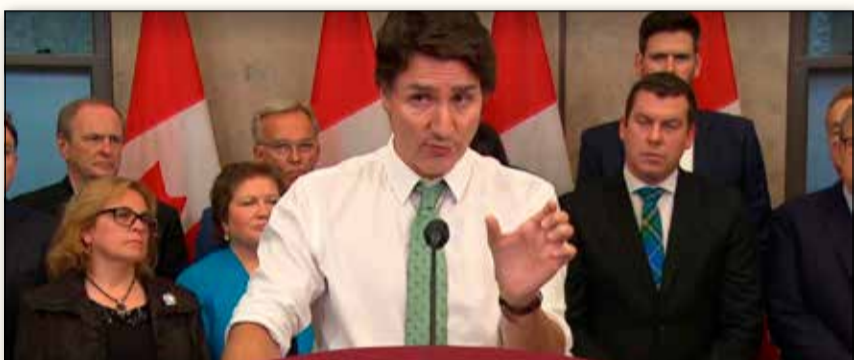
PM Trudeau announcing a carbon tax break for heating oil last year.

Vol. 13 - Issue 45 | Wednesday, November 6, 2024