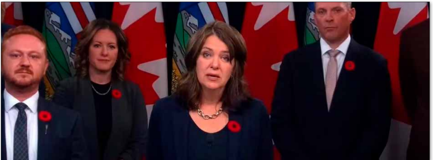
The provincial government is back in court against the federal government. After some big wins this year, including both the plastics ban and bill C-69 ruled unconstitutional, following challenges from Alberta, the province is back at it, and this time all aim is on the carbon tax. Premier Smith announcing her government's latest court challenge against feds.

As the colours of autumn paint our forests, we remind you to take necessary precautions to make this a safe season. From the last days of camping and hiking to the start of hunting season and the inevitable snow that follows, take a moment to make sure you and yours are best prepared. For all open career opportunities, please check out our website at albertanewsprint.com → Careers.